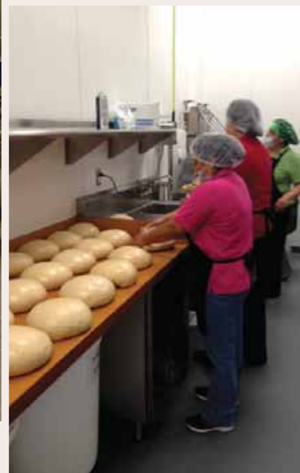
From left: the kitchen at Pahrump Valley Culinary School; preparing bread at the start of another day