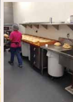
Staff work quickly in a large cook-chill area to prepare and refrigerate menu items that can be stored for up to 45 days

and emptied into serving pans – the dirty serving pans are returned to the central kitchen for washing.”